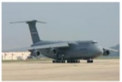
C-5 – 54 yrs (1968)