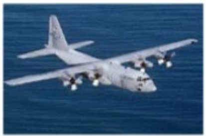
C-130 – 68 yrs (1954)