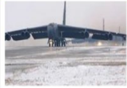
B-52 – 70 yrs (1952)