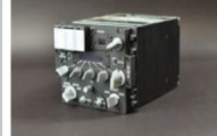
Radios – 42 yrs (1981)