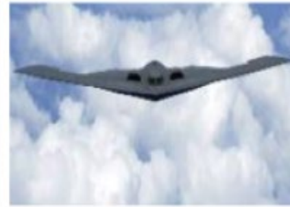
B-2 – 35 yrs (1987)