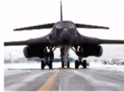
B-1B – 49 yrs (1973)