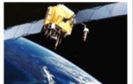
GPS – 27 yrs (1995)