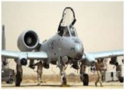
A-10 – 50 yrs (1972)