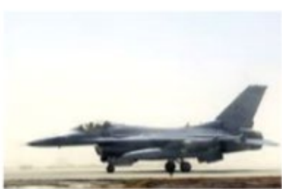
F-16 – 49 yrs (1973)