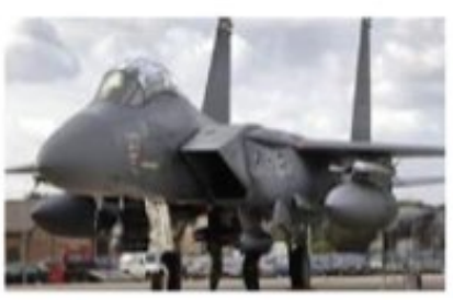
F-15 – 50 yrs (1972)