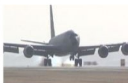
KC-135 – 67 yrs (1955)