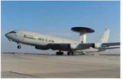
E-3A – 45 yrs (1977)